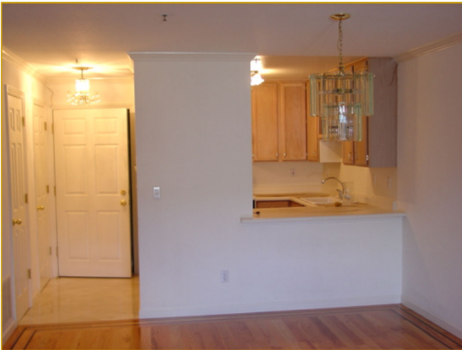
View of front entrance and kitchen from the living room.