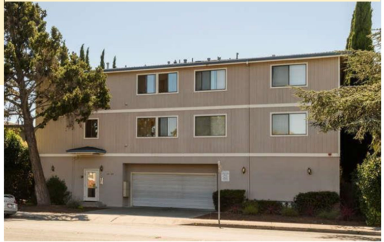
Front of building. Unit is in the back, corner